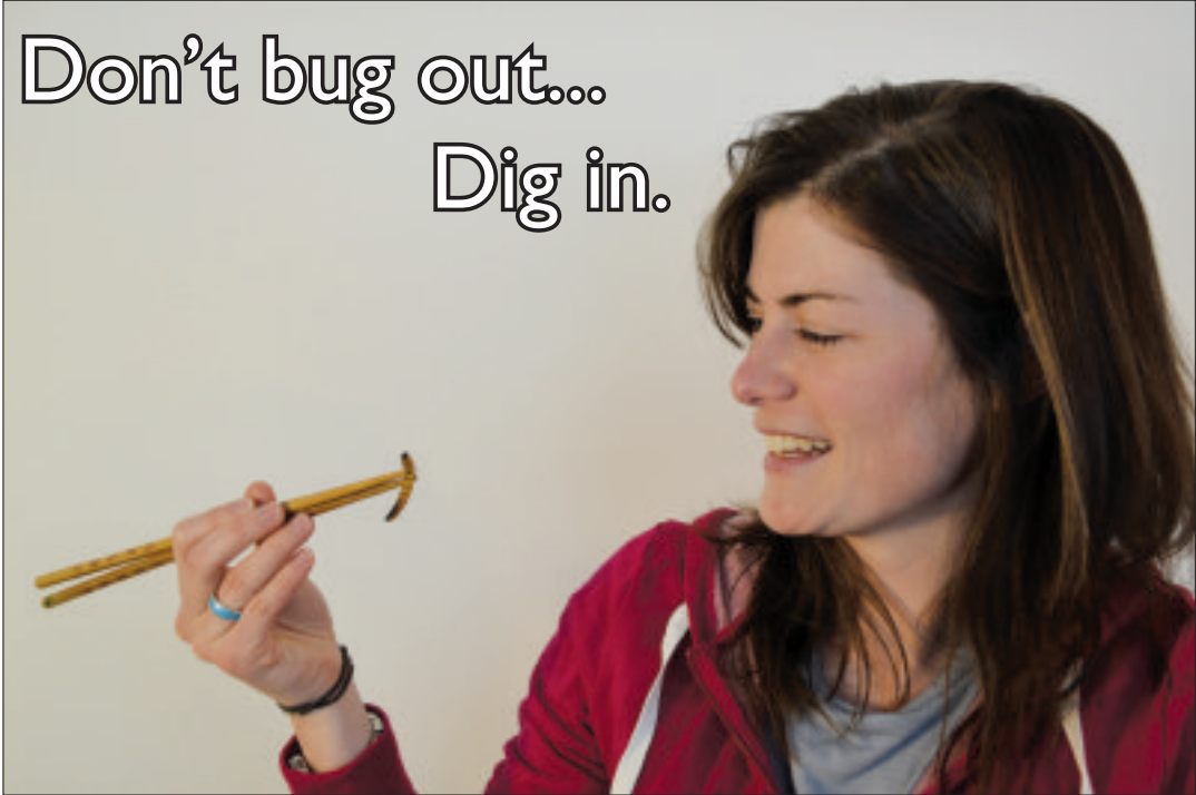
Two billion people around the world consume insects on the regular, says Laura Shine. Could bugs take centre-stage on our plates in the not-so-distant future? Turn to page 12 for our story on one Chelseaite's take on this growing foreign food trend.